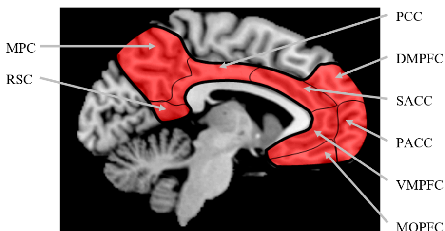
Figure 1. Cortical midline structures marked in red colour. MOPFC = medial orbital prefrontal cortex, VMPFC = ventromedial prefrontal cortex, PACC = pre- and subgenual anterior cingulate cortex, SACC = supragenual anterior cingulate cortex, DMPFC = dorsomedial prefrontal cortex, MPC = medial parietal cortex, PCC = posterior cingulate cortex, RSC = retrosplenial cortex. Note that there are no clear anatomically defined borders between the different regions. Adapted from Northoff et al. [2].

A larger network of brain regions, including these cortical midline structures, in addition to the tempo-parietal junction and the anterior temporal gyrus, has been defined as the so-called social brain. This network was found to be more active during processing of social words versus non-social words [16]. More specifically, the processing of words that reflected each participant's individual group belonging (e.g., religious group or nationality) versus out-group words was associated with activity at the ventral medial prefrontal and the anterior and dorsal cingulate cortex. These structures are again part of the cortical midline network, and the respective findings thus confirm their engagement in self-referential processing while even extending it to a social context. Interestingly, Raichle et al. [17] introduced the science community to the so-called default mode network, which showed consistent deactivation across brain structures, such as the posterior cingulate cortex, the medial prefrontal cortex, and the medial, lateral, and inferior parietal cortex, while one is not focussed on the outside world and not engaged in any task (see also [5,18–20]). These areas seem to have a high degree of functional connectivity in the brain's resting state. The striking thing is that the common deactivation in this neural network turns into activity during self-referential processing (e.g., [21]) as in first-person perspective [22] and sense of agency [23].